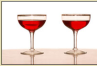
Polymeric Biomaterials 2 Volume Set Third Edition 1